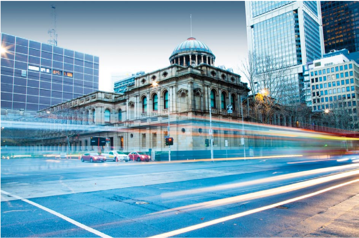
3. Court's (in)action?