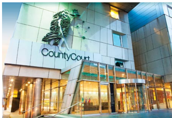
2. County Court, Melbourne.