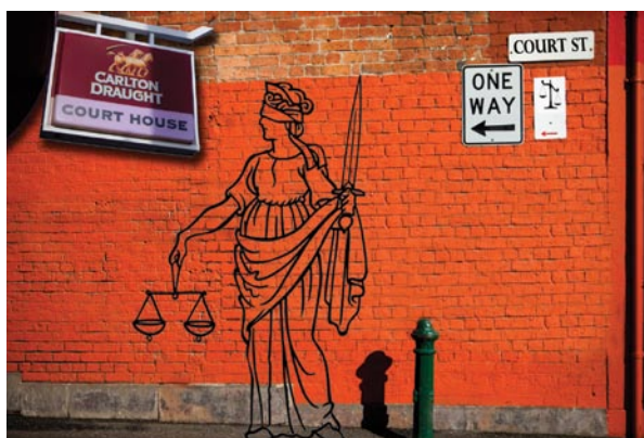
4. Signposting Justice.

We therefore see an interesting role for both professional and amateur photographers in deconstructing official images of justice and substituting these with new images that portray different roles for lawyers and judges in a more democratic society. As John Berger (1972, 182) has noted, photography is ‘...a weapon which we can use and which can be used against us.’