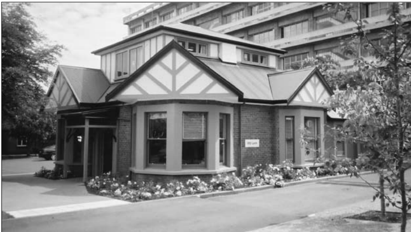
Disability Information & Support's offices are located in this building