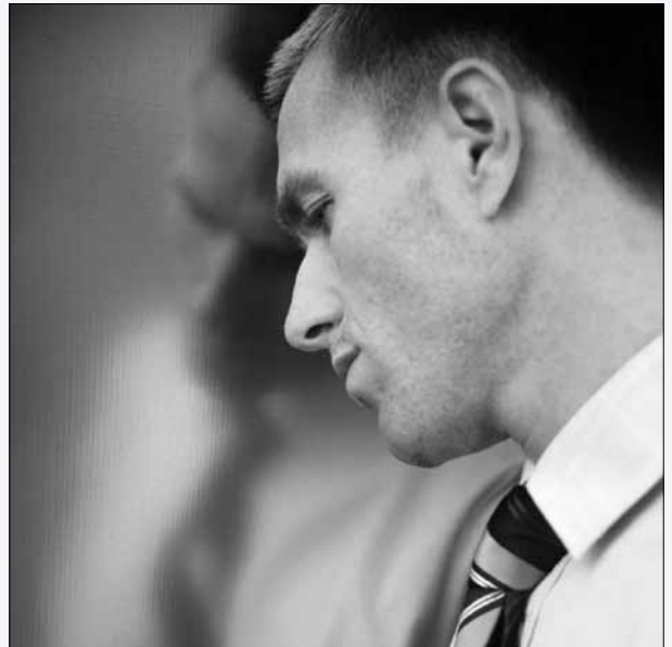
Hiding mental illness from employers and colleagues creates extra tension for workers fearing discrimination.