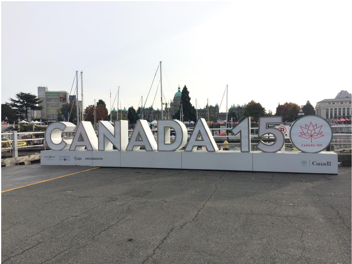
Consider a ferry (17.80CAD) over to Vancouver Island to visit Victoria