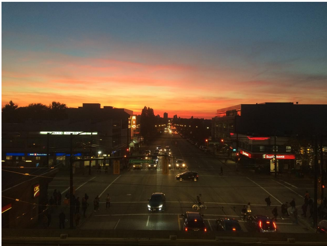
Sunset over Commercial Drive, Vancouver

Exchange was an amazing experience, it taught me independence, got me out of my comfort zone, and was a great way to see the world. I would highly recommend it to anyone looking for adventure, a different style of learning or for a new look on life. You won't regret it.