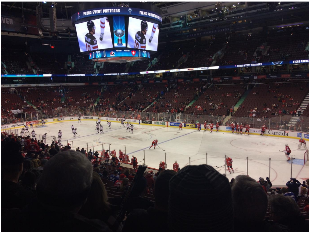
Canada vs Switzerland during the 2019 IIHF World Juniors at Rogers Arena, Vancouver