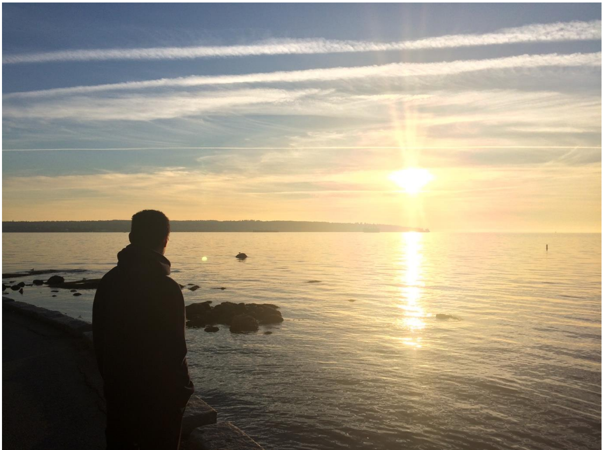
Sunset over UBC from the Stanley Park seawall, Vancouver