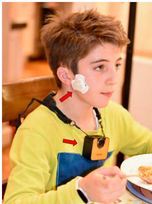
A young adolescent wearing our electromyographic device and the wearable camera (indicated by arrows) as used in the study.

This study aimed to collect objective data on masticatory muscle activity during wake-time in the natural environment using a smart-phone assisted wireless electromyographic (EMG) device; and to compare the features of masticatory muscle activity between females with myogenous temporomandibular disorder (TMD) and age-matched pain-free controls.