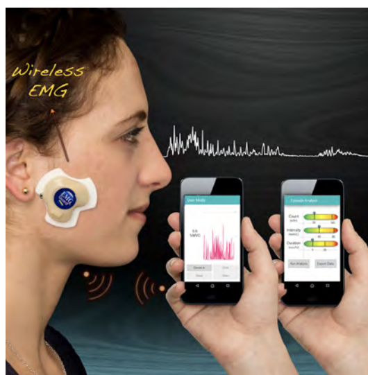
Smart-phone assisted EMG device developed at the University of Otago for continuous monitoring of jaw muscle contractions. The device provides a comprehensive analytical tool to estimate when, how often, how long, and how strongly the jaw muscles contract.

EMG activity was detected unilaterally using a minimally invasive wireless EMG device attached to the skin overlying the masseter muscle and connected to a smart-phone serving as data logger (above). Study participants performed a series of standardised tasks in a laboratory setting, wearing both the wireless device and reference standard EMG equipment, and then wore the wireless device for at least eight hours while performing their normal routine activities. For our second aim, EMG activity was collected in females with myogenous TMD and in age-matched pain-free controls while performing