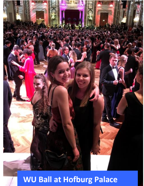
WU Ball at Hofburg Palace