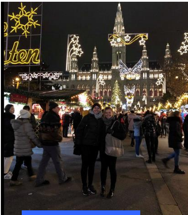
Rathaus Christmas Market