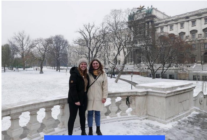
Snow day in Vienna