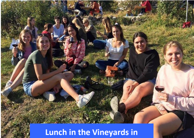
Lunch in the Vineyards in Vienna

My exchange experience was so much more than 3 months in Vienna – it allowed me to travel Europe for 7 months – so make the absolute most of this opportunity you are getting! There will be times when you are out of your comfort zones but they will be your best experiences! I learnt a lot about myself and grew so much. GO ON EXCHANGE