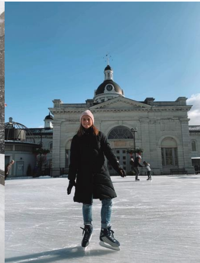
Ice-skating in the town square