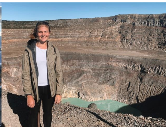
Santa Ana Volcano, El Salvador