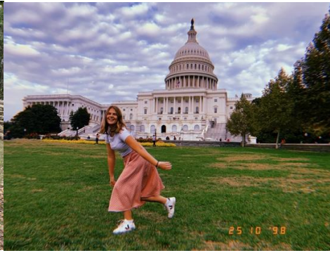
Capitol Building, Washington DC