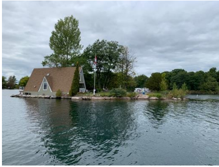
Thousand Islands Boat tour