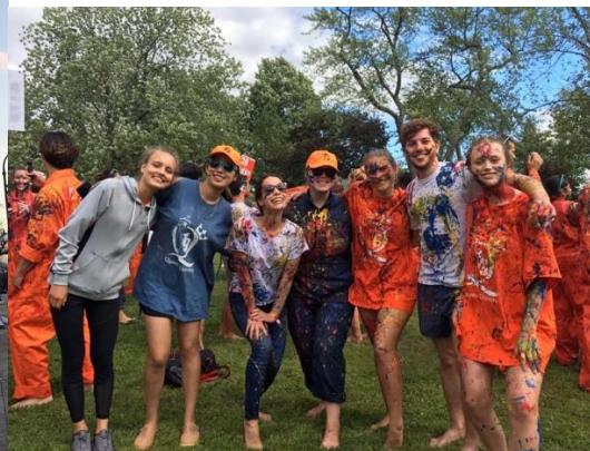
Orientation week paint party