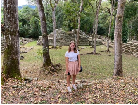
Copan Ruins, Honduras