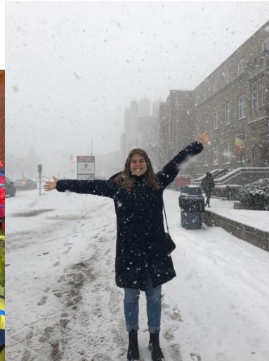
Snow on Campus