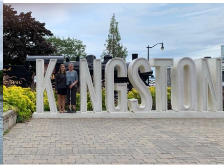
Kingston town sign