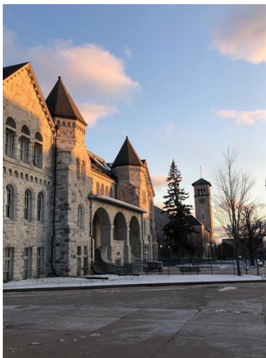
Winter sunset on campus