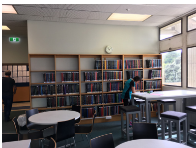
Hardbound theses dusted, sorted, and shelved by year.