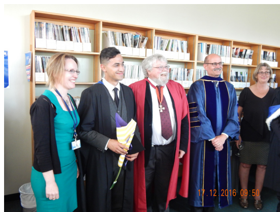
Graduates at the December function. Academics with the most spectacular regalia are in demand for photos!

As has become traditional, we held receptions in May and December for our graduating students and their families. These occasions are most enjoyable for us, and we hope for the families. We have so many graduating each year, however, that the reception is beginning to extend out of the Staff Room and into the hallway! In addition to the twelve PhD students finishing this year, we have had six MSc, and seven BSc (Hons) complete their studies in the department.