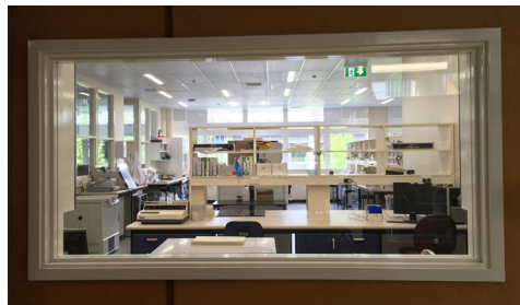
The new second floor labs have a window into the corridor, through which visitors can watch science being done.

Catherine has well and truly settled in to her HOD job, and has been making some big changes around the department. In addition to the renovation of the second floor east laboratories (completed in February of 2016) we have new furniture in the Reading Room/Staff Room for the very first time since the building was constructed! We have also had a major tidy up of the theses, and put a number of pieces of old equipment on display in the shelves as a sort of mini-museum. New carpet and other changes will follow when the building is no longer a construction site. Right now much of the first floor is under development with further upgrades planned for next year.