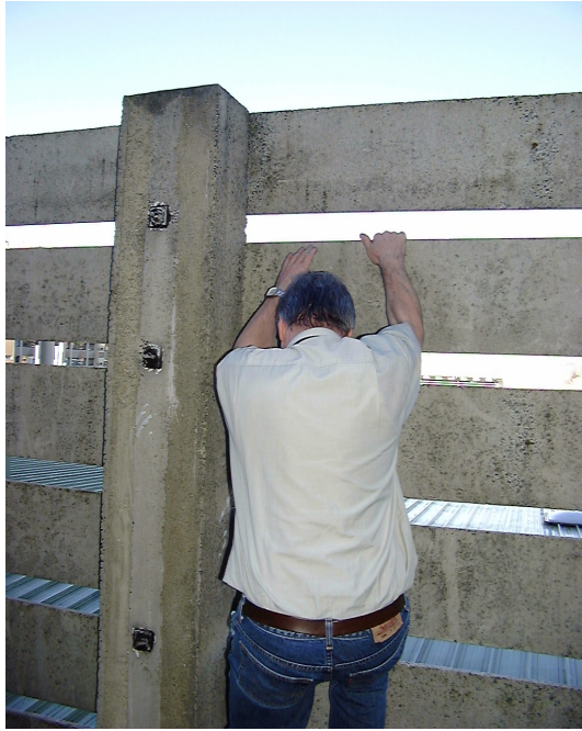
Murray's first attempt to escape the Department.