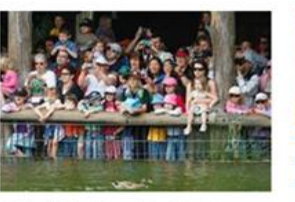
Auckland Zoo's visitors will have to go to a designated area of the carpark if they want to smoke.

Some organisations perceive that smoking in public places is becoming less acceptable and want to be seen as supporting healthy lifestyles.