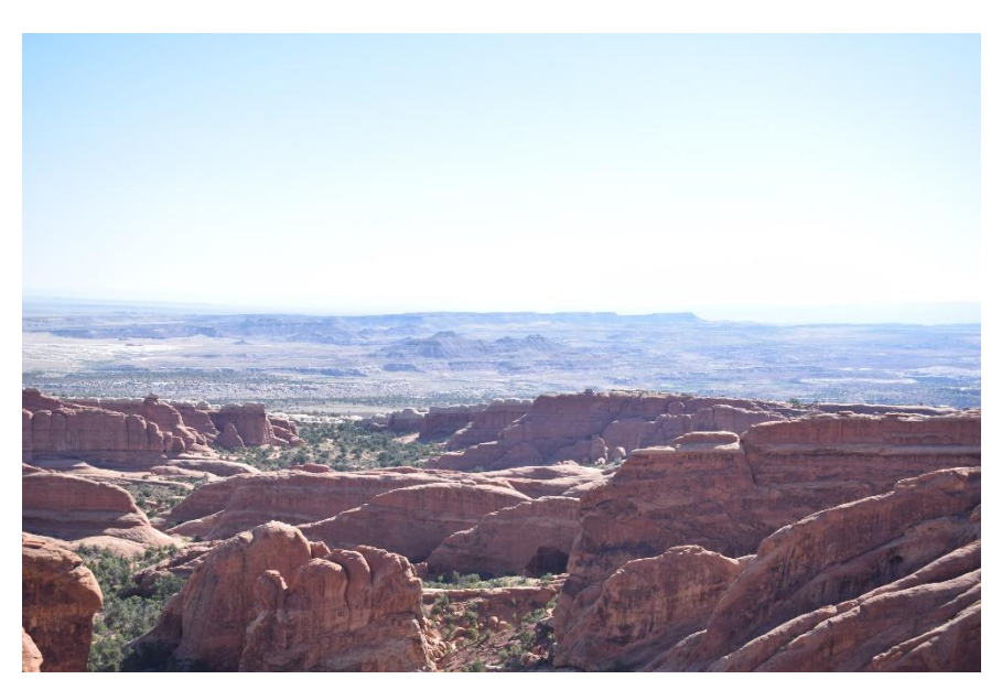
3 ARCHES NATIONAL PARK, UTAH