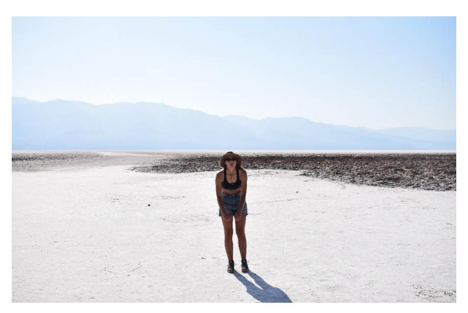
2 DYING IN DEATH VALLEY BECAUSE IT WAS 50 DEGREES