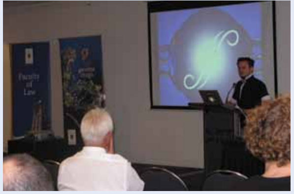
Whether in the sporting arena, the genetics lab or the exam hall, new technologies present new challenges for ideas of 'fairness' and 'justice'. Two Otago University centres have

NEW ZEALAND LAW FOUNDATION CENTRE FOR LAW AND POLICY IN EMERGING TECHNOLOGIES – FUTURE OF FAIRNESS SYMPOSIUM MARCH 2011