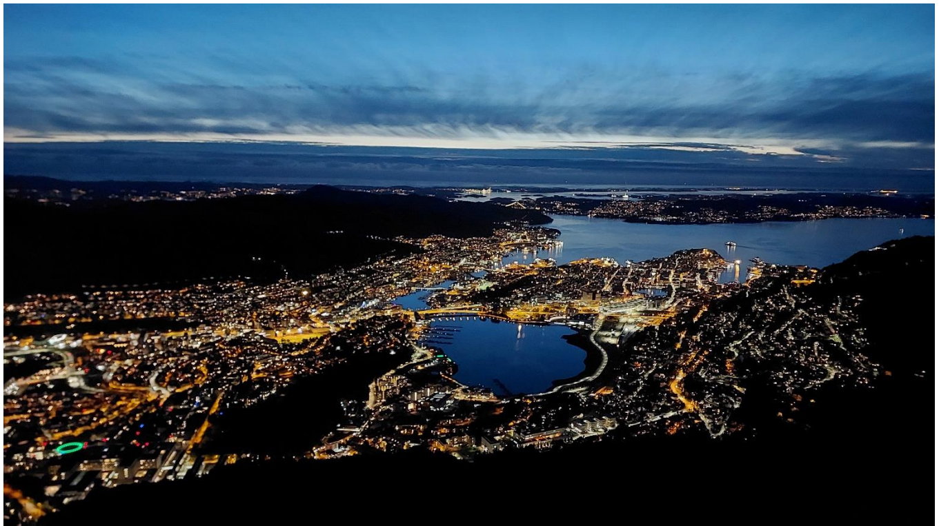
Sunset beers watching the night lights of Bergen from Mt Ulreiken