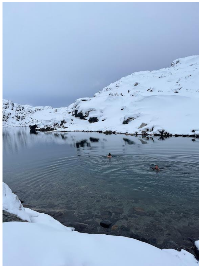
A trip in late autumn in the mountains where all of our bottles froze and we were surprised with how cold it was!