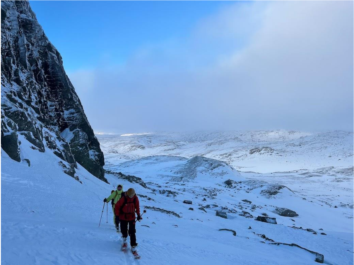
Ski touring out the back of Finse, very cold -18 degrees down by the frozen lake!