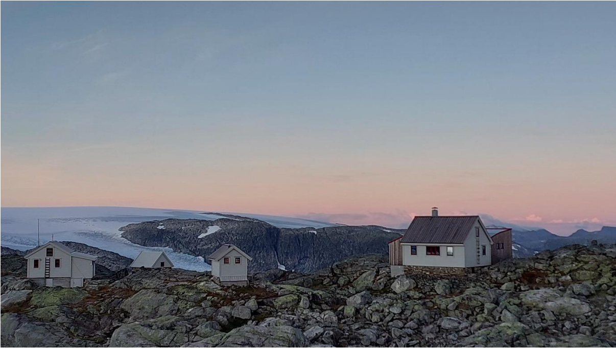
Summer hut trip in the warm weather