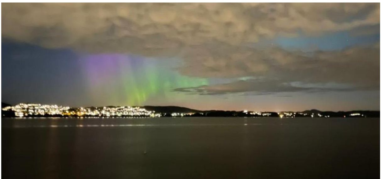
Northern lights just 30min bus ride from my student accommodation in Bergen!