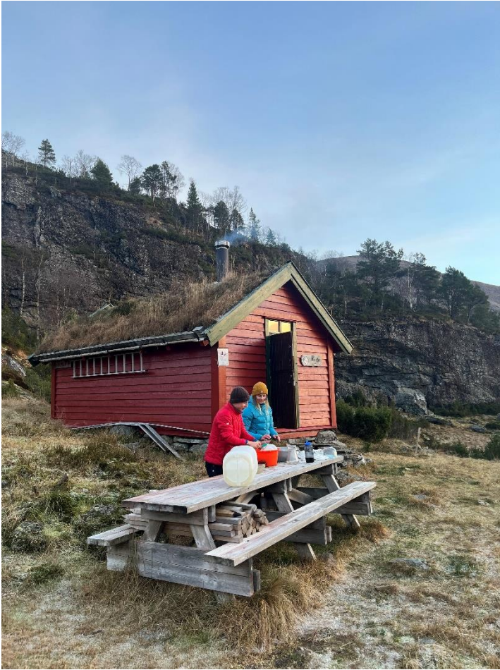
A hike in winter with clear skies and -12degrees