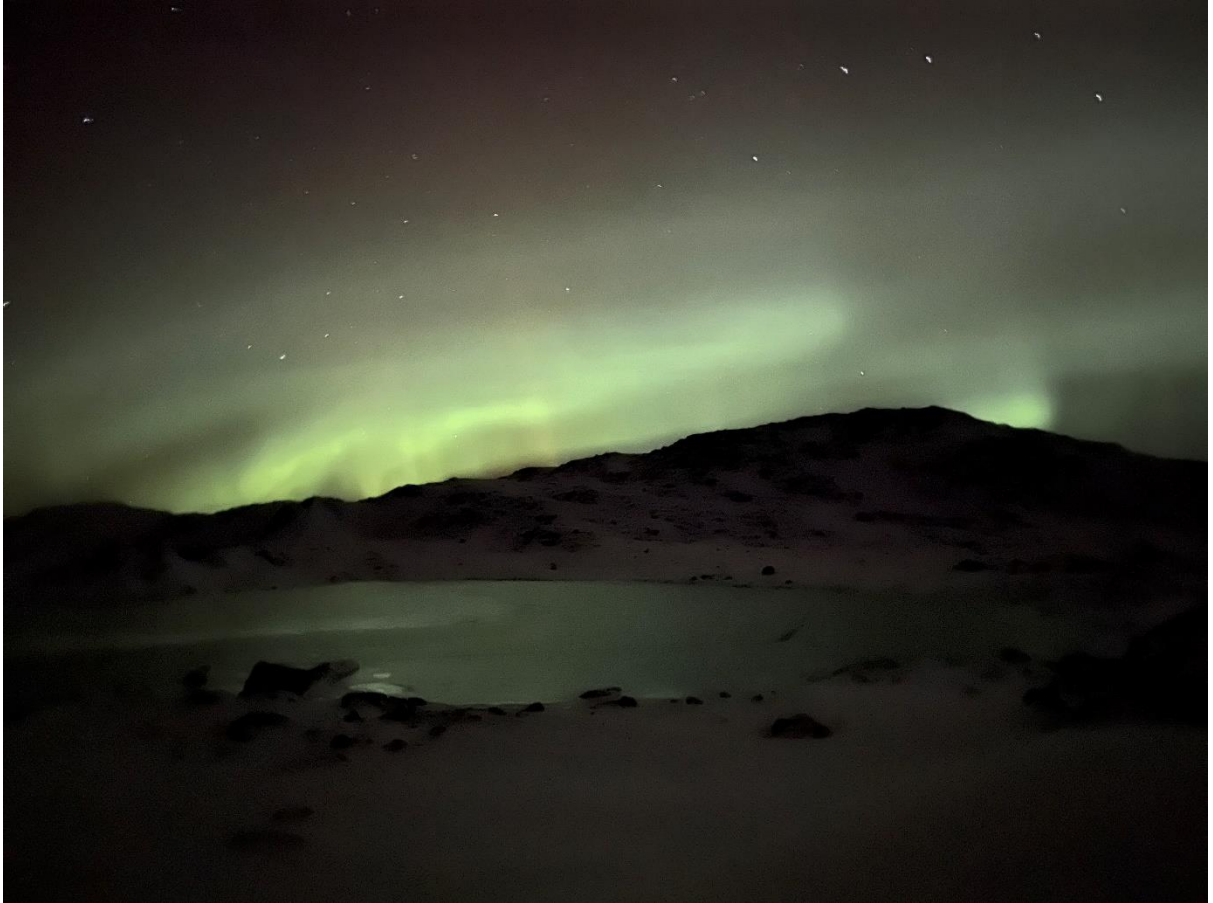
Northern lights on a multiday fjellski trip