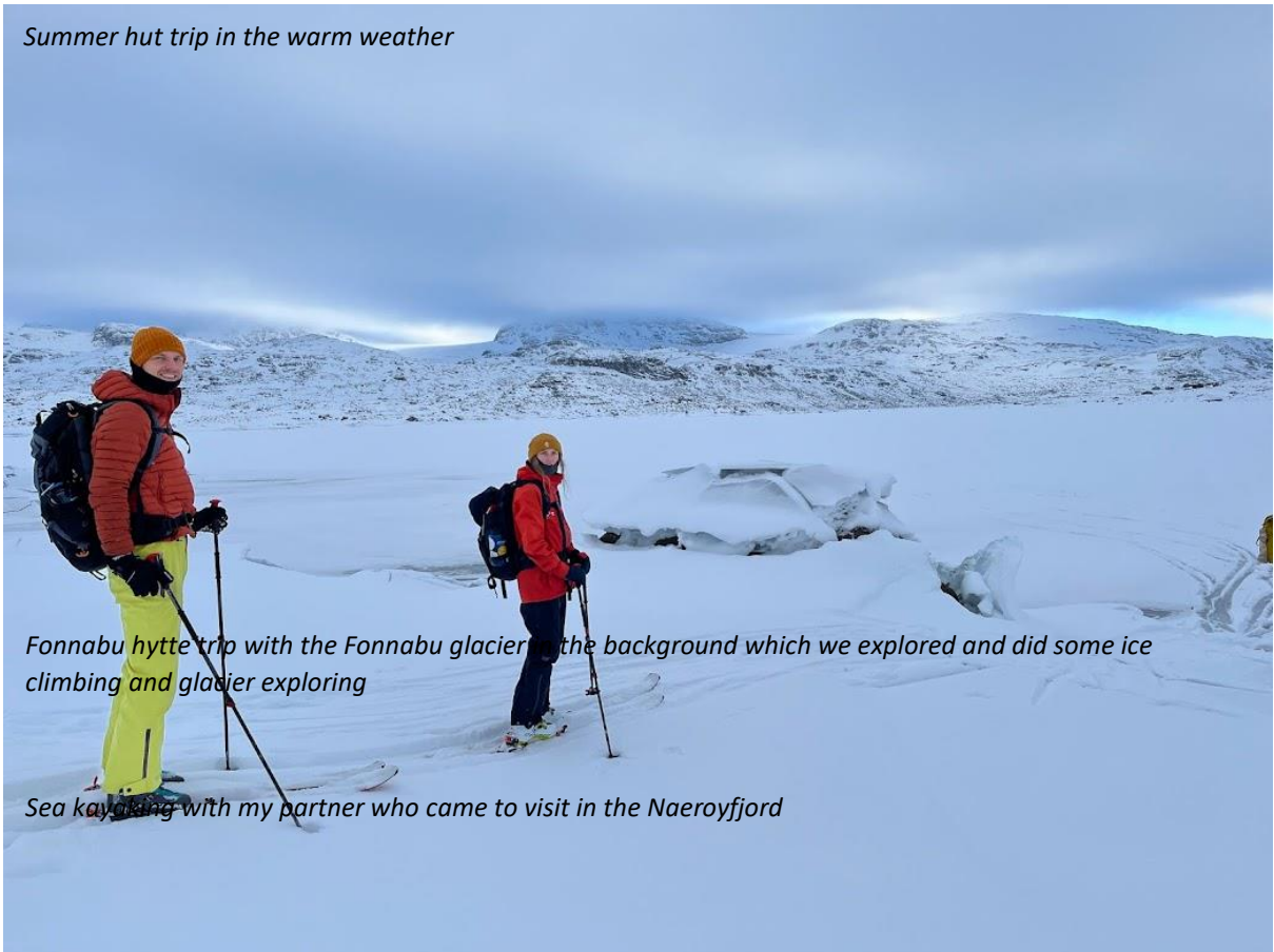
Fonnabu hytte trip with the Fonnabu glacier in the background which we explored and did some ice climbing and glacier exploring