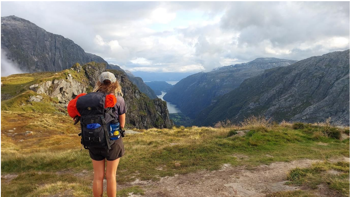
Another beautiful hike, 3 days