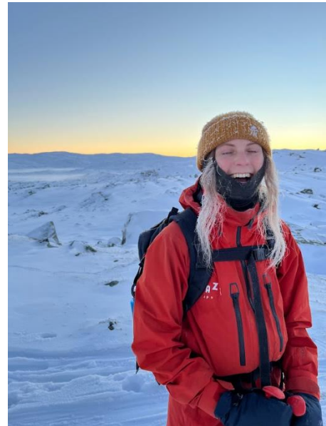
Photo: enjoying my frozen eyelashes while out on a back country ski touring

The university in Bergen was well equipped, very accommodating to exchange students and overall was a very enjoyable university experience. The Norwegian people are very kind and willing to lend a helpful hand and they love kiwis! I recommend the challenge of a non-English speaking country, I feel I gained valuable cultural knowledge from