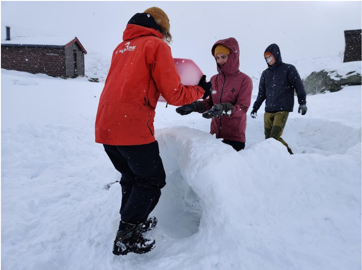
Building an igloo beside our cabin to fill in the day after we decided to stay another night because the snow was so amazing