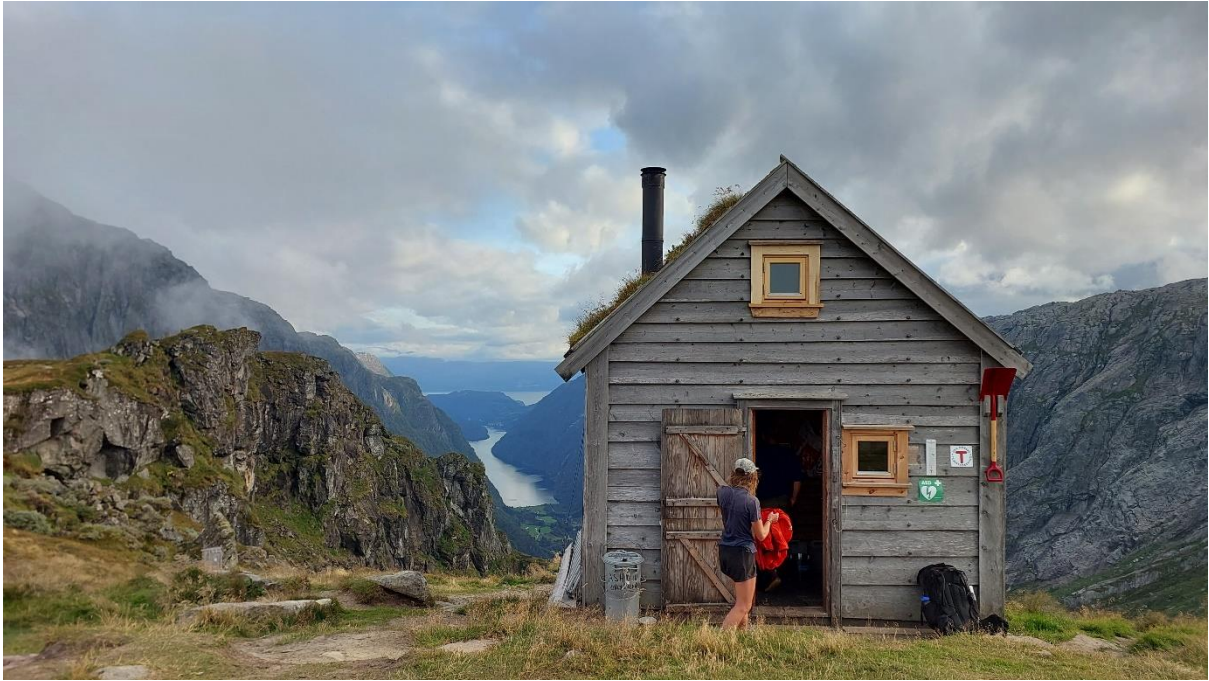
A solo hike to Nansenbu cabin 6hrs walk from a small town called Voss