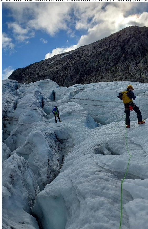
Exploring Fonnabu glacier with my two friends