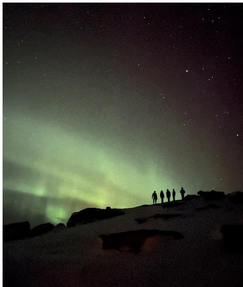
Photo: while on a 3 day fjellski trip in the mountains we came across an amazing display of northern lights outside our small cabin!

many European countries as most exchange students were from Europe (I didn't meet a single kiwi or Australian).