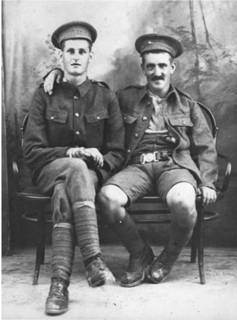
World War One, 1914—18: New Zealanders Overseas - Reader Access File, Pictorial Collections.

Hocken Collections/Te Uare Taoka o Hākena 90 Anzac Ave, PO Box 56, Dunedin 9054 Phone 03 479 8868 reference.hocken@otago.ac.nz https://www.otago.ac.nz/library/hocken/