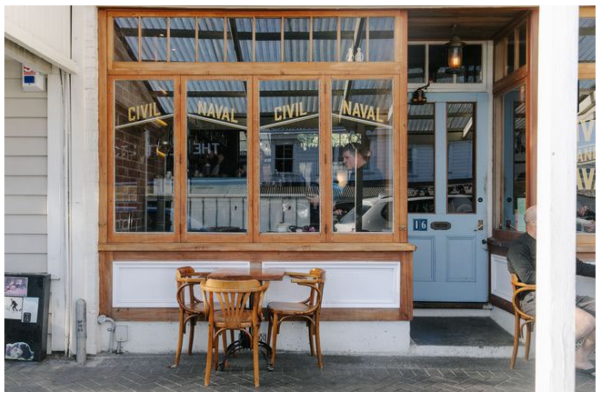
neatplaces.co.nz is a great source of local hotspots

Or, jump on a bus out to Lyttelton for the best fried chicken and cauliflower in Christchurch at <u>Civil</u> and Naval.