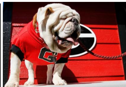
Figure 3: University of Georgia bulldog, Uga