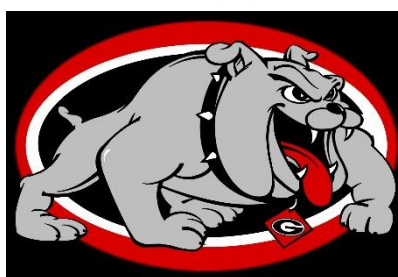
Figure 2: University of Georgia bulldog (cartoon)