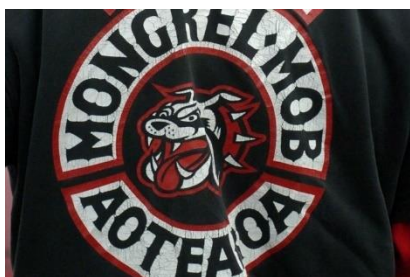
Figure 1: Mongrel Mob insignia