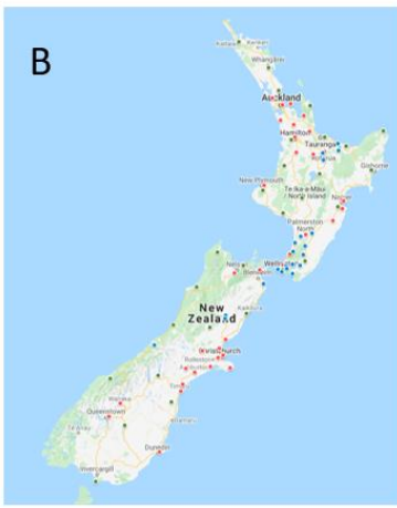
Difference VRS coordinates and NZGD2000