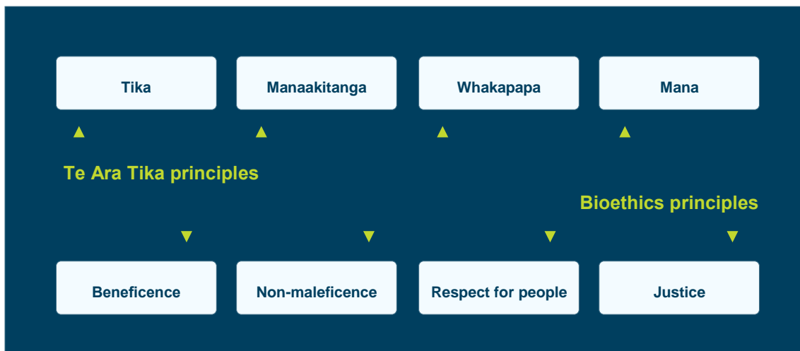
Figure 2.1 – Overview of Te Ara Tika and bioethics principles