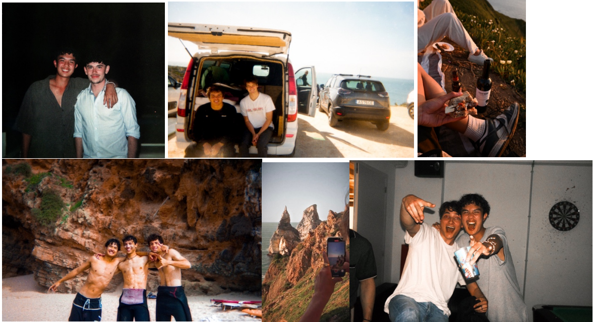
My mid semester break in Morocco