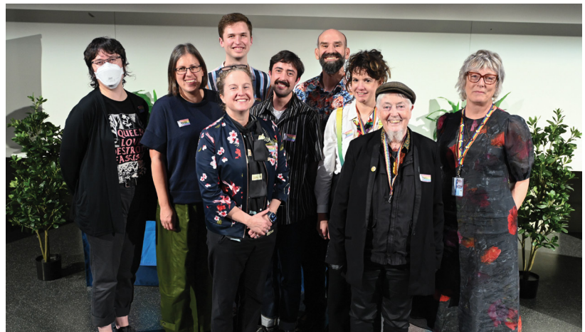
Some of the pride symposium presenters in the Nordmeyer Theatre.