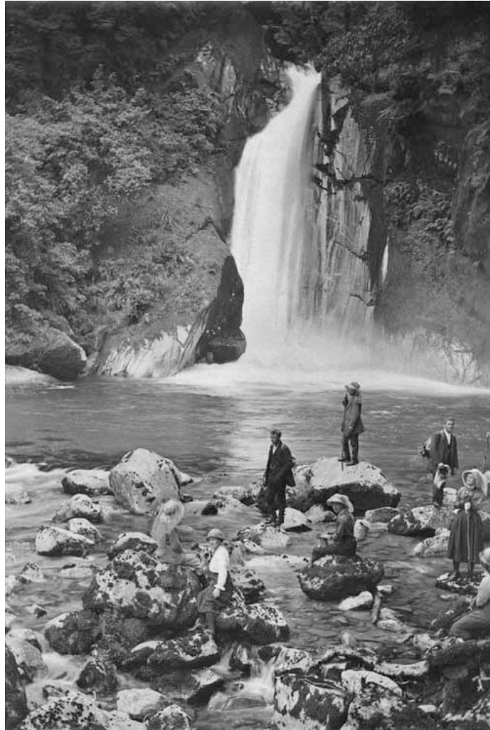
The Giants Gate, Lake Ada, Milford, 1900-1930.

Hocken Collections/Te Uare Taoka o Hākena 90 Anzac Ave, PO Box 56, Dunedin 9054 Phone 03 479 8868 reference.hocken@otago.ac.nz https://www.otago.ac.nz/library/hocken/