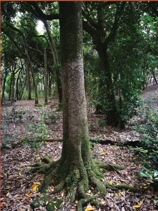
A carved kopi tree on Rekohu