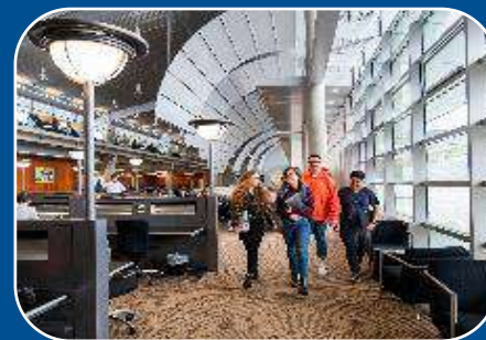
Humanities & Social Sciences