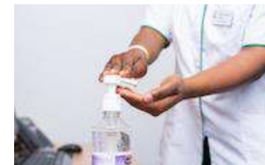
Major health issues research