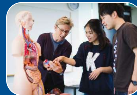
Pathway/ Foundation & English Language Centre