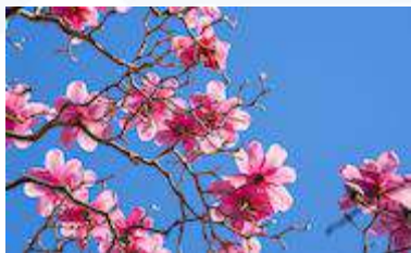
Aotearoa in Asia-Pacific research