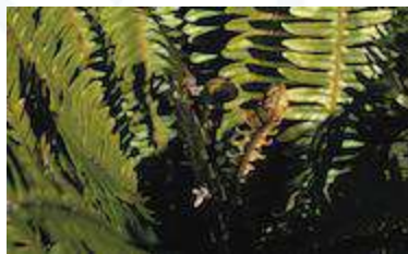
Identity and culture research