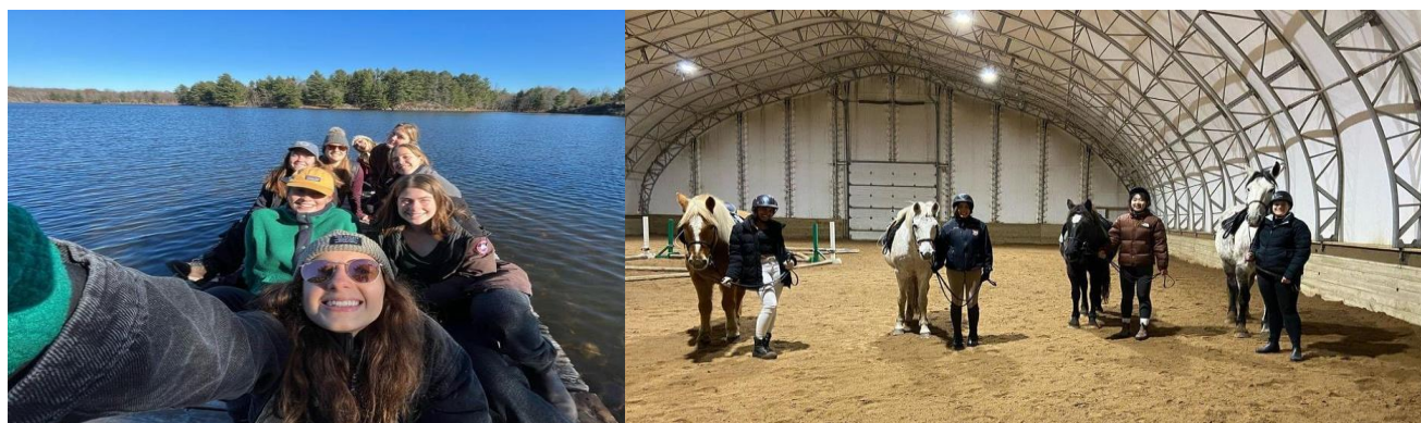
Weekend away with the Queen's Outdoor Club and riding lessons with the Queen's Equestrian Club