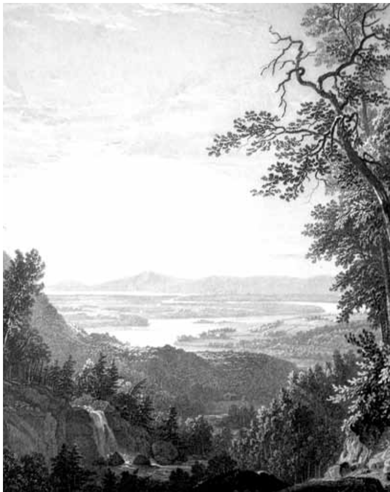
From Jane Porter's The Scottish Chiefs, 1856 edition. Appleton, New York.