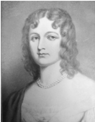
Felicia Hemans.

In 1800, due to financial difficulties, the Brownes resettled in Gwrych, near Abergele, in North Wales. This relocation proved inspiring for the young Felicia and the Welsh landscape had a powerful influence on her imagination; her later poetry frequently reflects the isolated beauty of the environment.