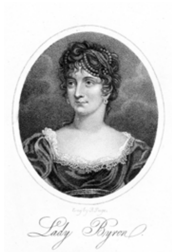
Lady Byron, age twenty-four (National Portrait Gallery). 1

The inclusion of Lady Anne Isabella “Annabella” Noel Byron [née Milbanke] (1792–1860) in this book may appear slightly anomalous. She shares these pages with leading female literary figures of the