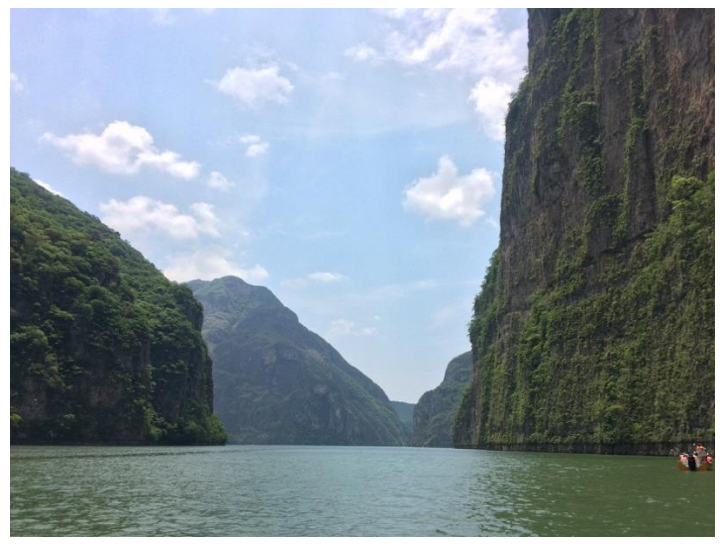
Sumidero Canyon, Chiapas