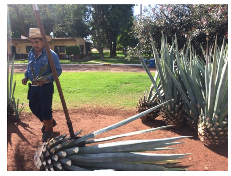
Tequila factory, Tequila, Jalisco