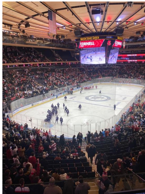
Ice hockey game at Madison Square Garden