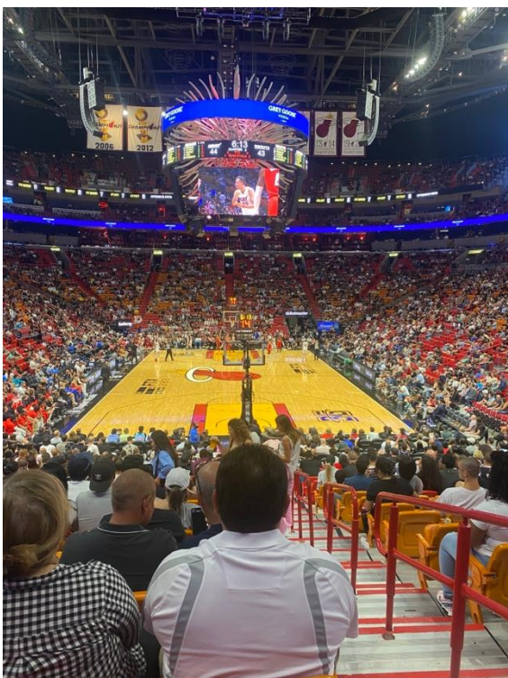
NBA game whilst in Miami