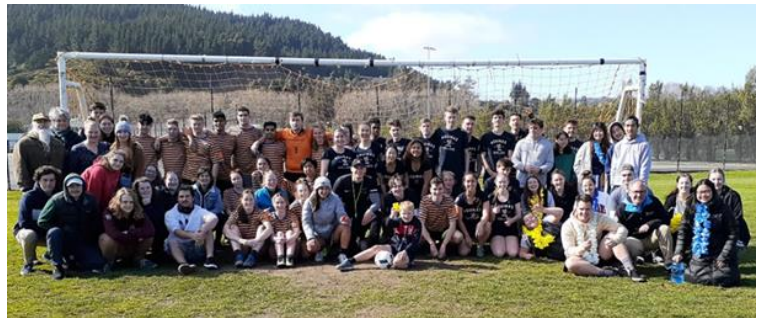
Photo above: The jubilant Football Team and Supporters after winning their game against Aquinas College

The Games Competition was new for 2019 and the residents took to it with ever present enthusiasm. 3rd Place was achieved in the Quiz and 2nd Place in the Puzzle Mania. 5th overall.