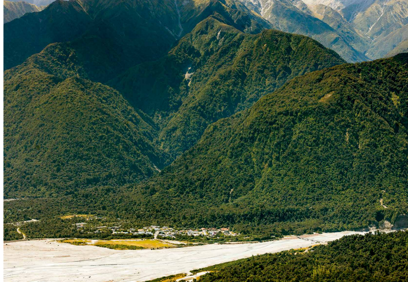
ABOVE — In 2017, experts recommended moving the entire town of Franz Josef, which sits on the faultline.