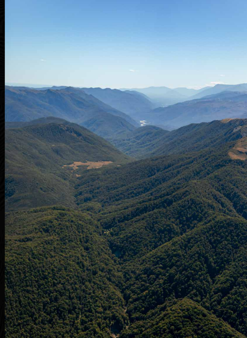
ABOVE RIGHT — A section of the Alpine Fault south of Haast.

dawned on me: the entirety of Te Waipounamu/the South Island would be hit very, very hard.