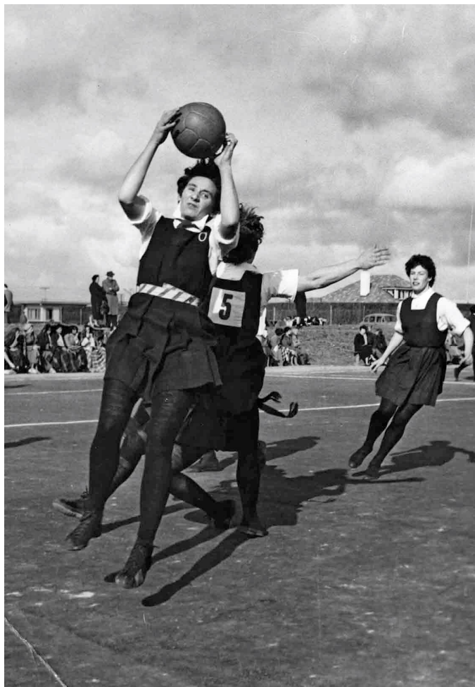
Netball game, 1953.