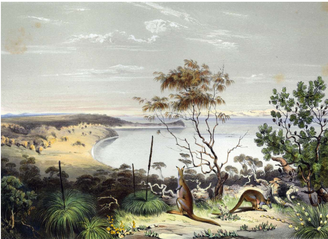
'Scene on the Coorong, near Lake Albert. With the Halmaturus Greyii , a new species of kangaroo.' South Australia Illustrated by George French Angas, London: Thomas McLean, 1847. Publications Collection, s15-546b.