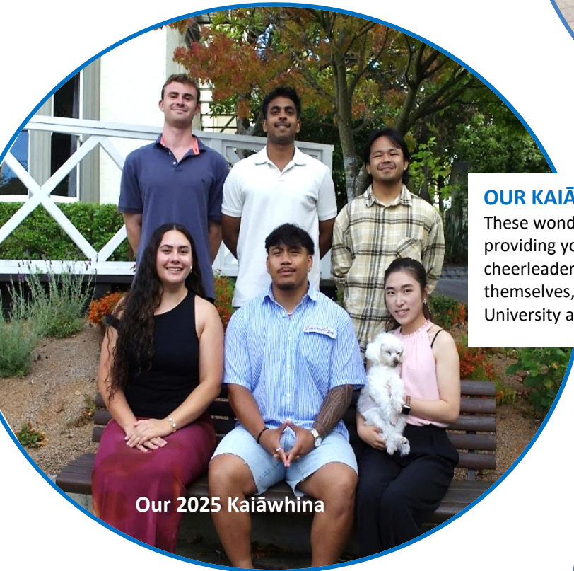
Our 2025 Kaiāwhina

Our dedicated Catering staff are always up for a laugh and enjoy a bit of banter. They take tremendous pride in getting to know you, and you are encouraged to get to know them. They work 7 days a week to create tasty and nutritious meals for you to enjoy. Mealtimes are shown on page 10.