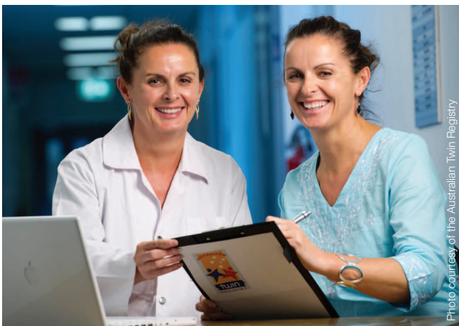
Twins play an important role in understanding genetic and environmental factors involved in the development of different conditions