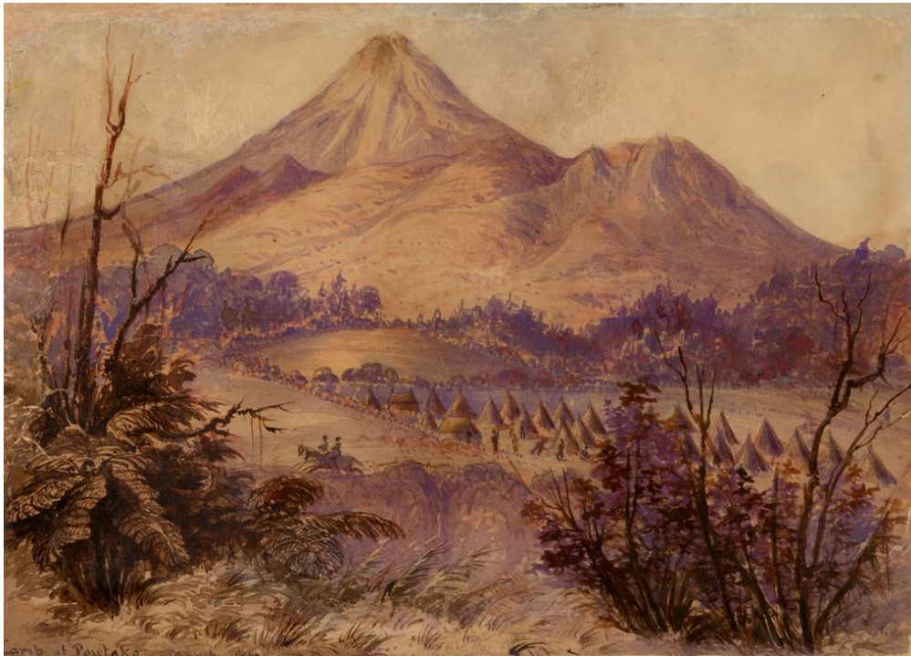
Henry Jame Warre. Camp at Poutoko (1863). Watercolour on paper: 254 x 353mm.