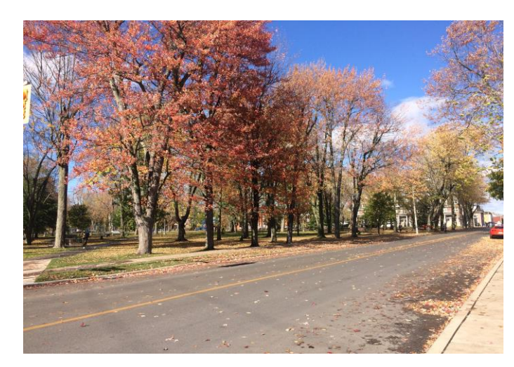
I experienced a range of weather from 30 degrees when I arrived, to -20 when I left. Make the most of seeing the autumn/fall colours they are bautiful.