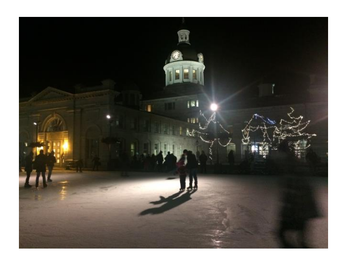
Ice skating on the outdoor rink at night