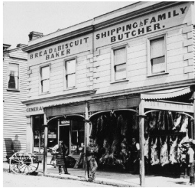
George St, PORT CHALMERS. 1860s. S04-124c.

The Index New Zealand database will help you find articles in Aotearoa New Zealand journals and newspapers such as the New Zealand Journal of History , NZ Listener , Otago Daily Times , and many others. It offers comprehensive coverage from 1987 onwards but does index some earlier journals – search at https://natlib.govt.nz/collections/a-z/index-new-zealand-innz . Print indexes are also available for comprehensive coverage of pre-1987 journals. Once you have found the references to relevant articles, check Library Search|Ketu to see whether we hold the relevant journal title and issue.