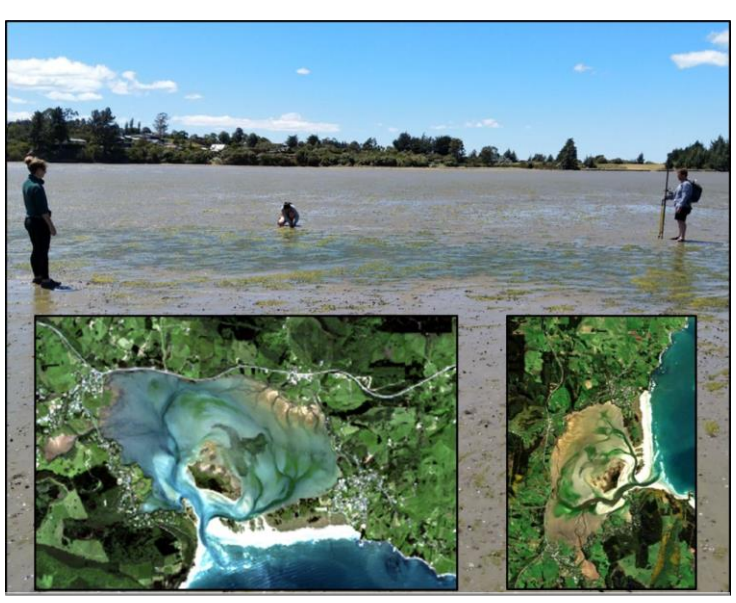
Quantifying Ulva cover in Otago Coastal Estuaries with Satellite Remote Sensing // Xuhong Chai and Laura Sterup