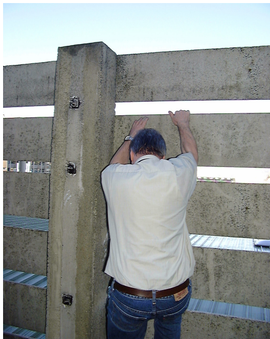
31st Dec 1999: Murray's first attempt to escape the Department.