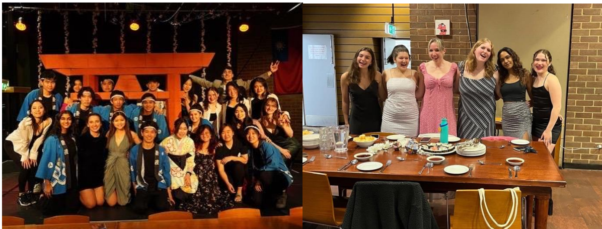
These pictures are from one of my most favourite nights at International House: Cultural Night. The country was Japan, so there was multiple Japanese performances, and Japanese food served for dinner. I am a dancer, so I was asked to be in the advanced dance piece for this night. I had so much fun going to rehearsals and learning the choreography one of my peers did. The entire cultural night team was absolutely amazing and so much fun to work with. The night itself was a huge success as well. I loved performing for everyone, the food was amazing, and afterwards we had a party where one of my friends got to DJ. Definitely one of the highlights of my exchange.