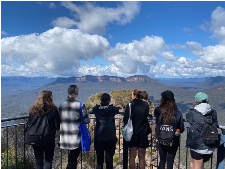
This picture is from our mid-semester break. Most of my friend group and I went to Sydney for the week. We stayed in a hostel together, and spent the week seeing the sites of Sydney. This picture is the day we went to the Blue Mountains!