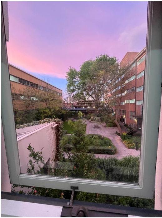
This is a picture of the view from my room at International House. The sunset was absolutely gorgeous!