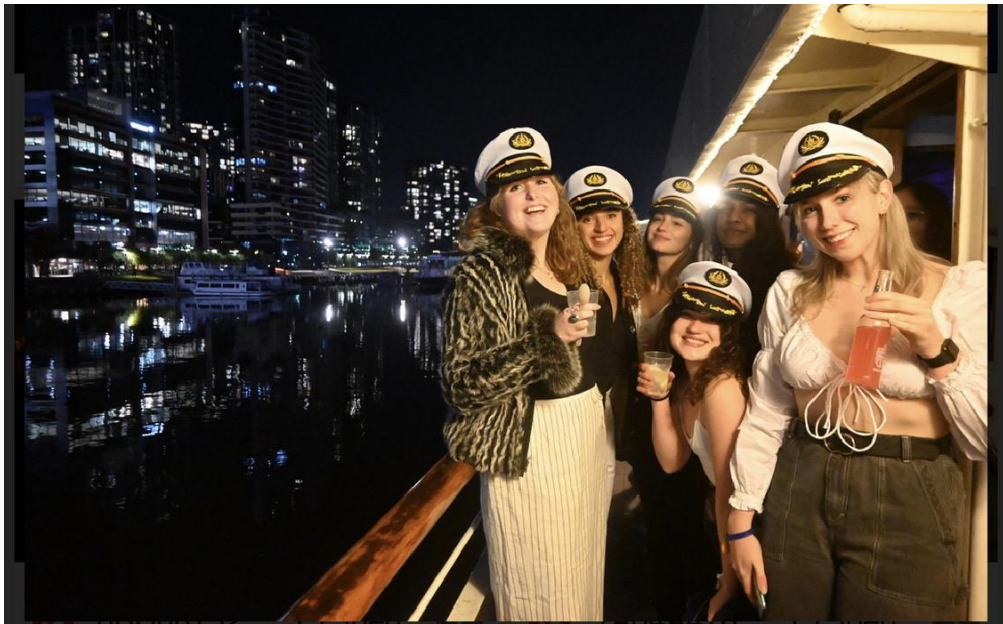
This picture is from the O week party our college, International House, threw. They rented a boat for the night and we sailed around the Melbourne harbour!