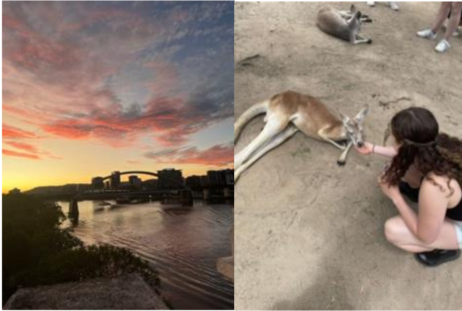
The left is a picture of the gorgeous sunset in Brisbane. On the right, this is from the Currumbin Conservatory in Gold Coast. I got to feed a Kangaroo!