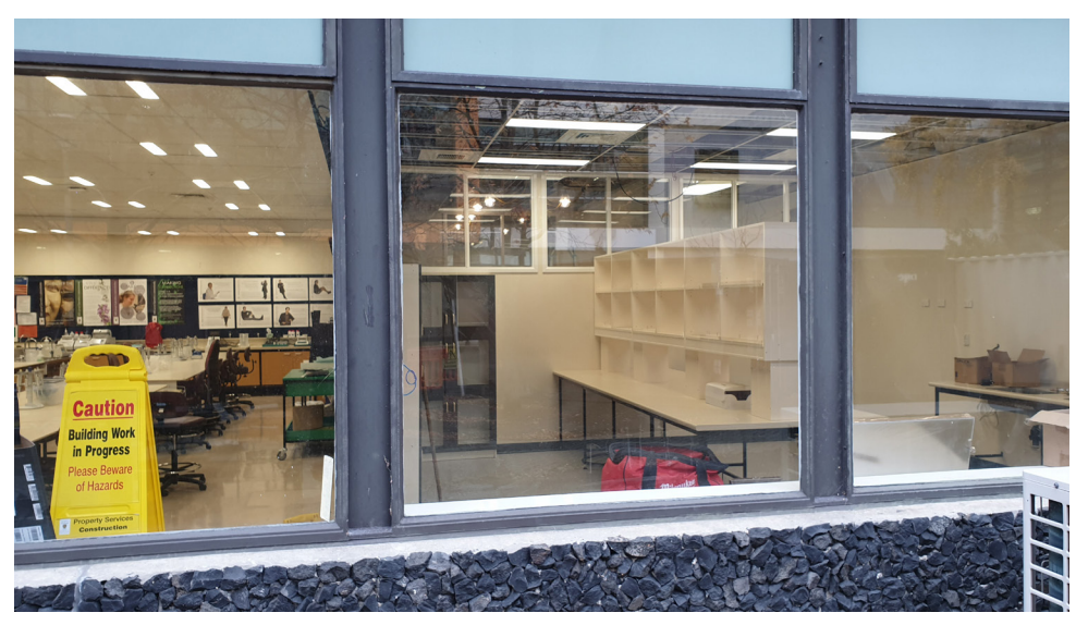
Genetics lab and prep room.