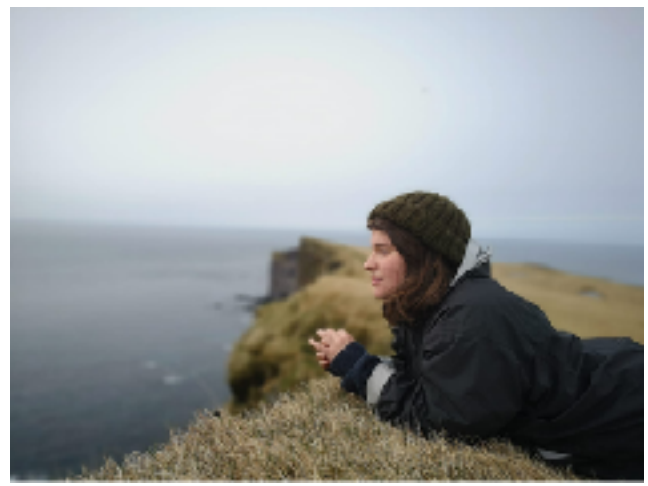
Me pretending to be pensive in the Westfjörds after an afternoon of unsuccessful puffin (did see an arctic fox though) watching - and I knitted that hat!