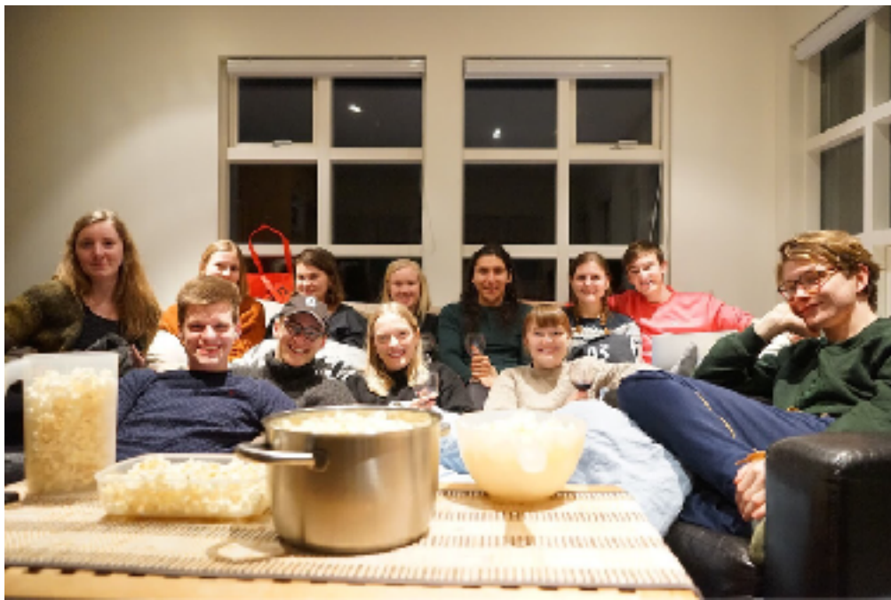
My blessed (mostly Scandinavian) mates, knitting up a storm and about to watch a trashy Netflix flick.