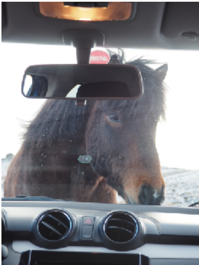
Roadblocked! Rented Suzuki Swifts are not match for these babes. Had to bust out some horse herding skills (skills that I do not have, nor ever plan to acquire).