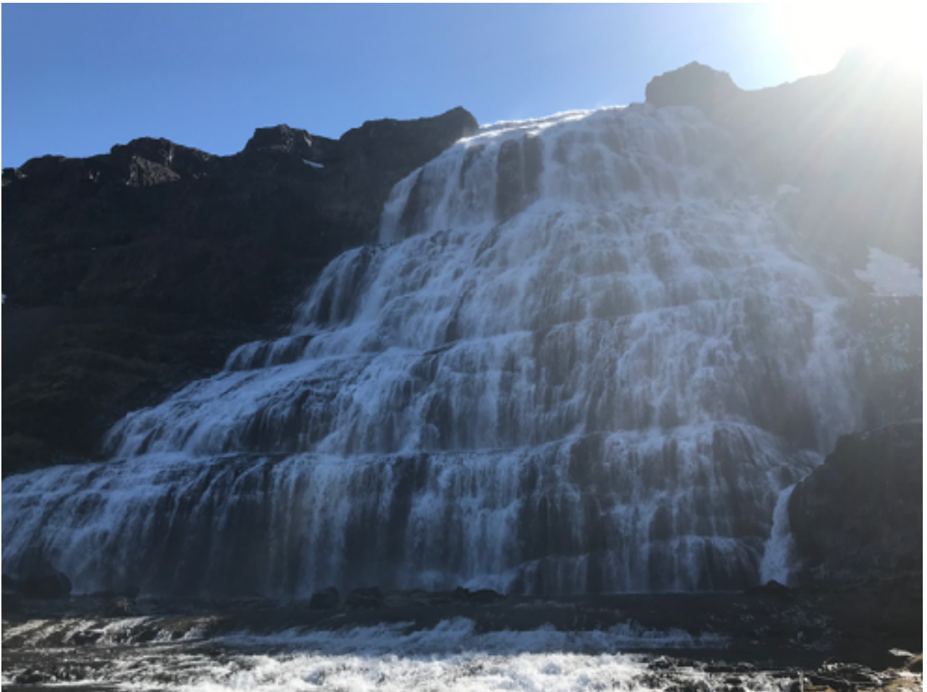
One of the most magnificent sights I have ever seen - Dynjandi waterfall in the Westfjords.