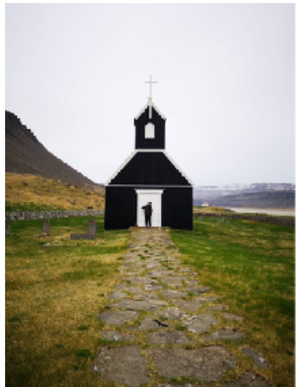
Goth Church moment? These gorgeous Lutheran churches are dotted all over the island, but this black one was special.