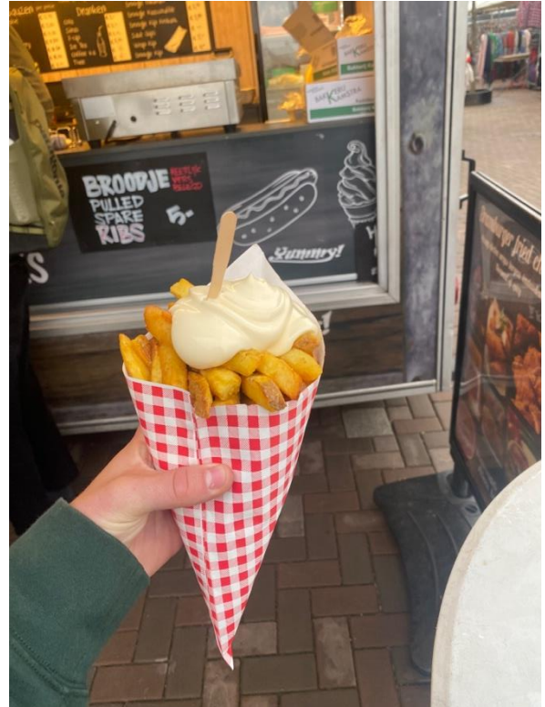
Pomme Frites met mayonaisse (Fries with mayonaisse) – a very Dutch snack!