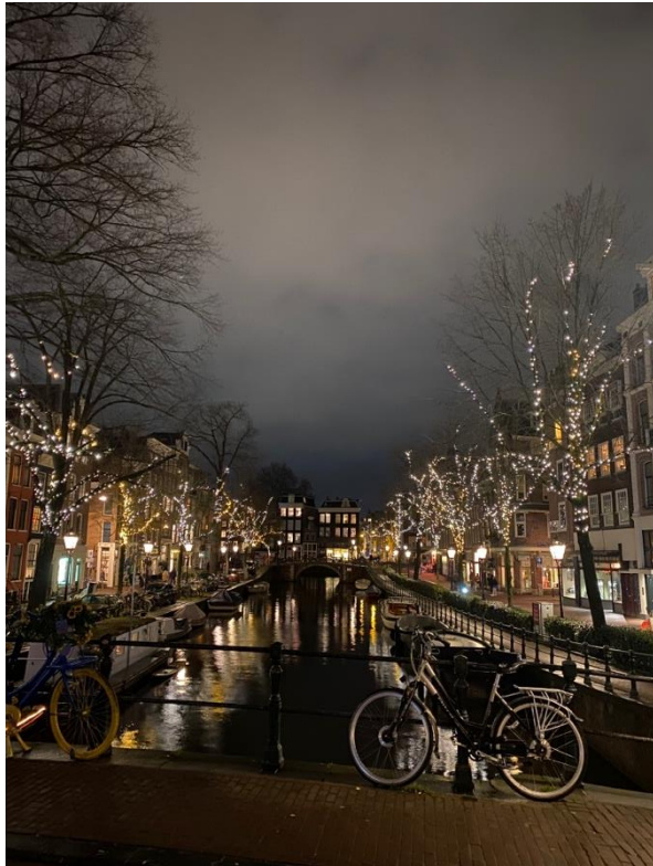
Amsterdam Canals at Night!!

Going on exchange to Amsterdam has been the most challenging and rewarding journey of my life. If I thought in February that saying goodbye to my family and everything I know would be hard, I had no idea how much harder it would be to say goodbye to Amsterdam and my new friends. 6 months has given me the opportunity to explore the world and get to know myself. But, by far the most valuable takeaway is the friendships I have made with people all over the world. It's crazy to think that in such a short amount of time I formed some of my closest friendships and now have second homes away from home. Exchange is about so much more than university and education: it's about exploring the world, gaining an appreciation of culture, meeting new people and making new memories. I have been fortunate enough to visit 11 countries on my exchange and still plan on doing 10 more whilst in Europe! Exchange will forever be one of my fondest memories.