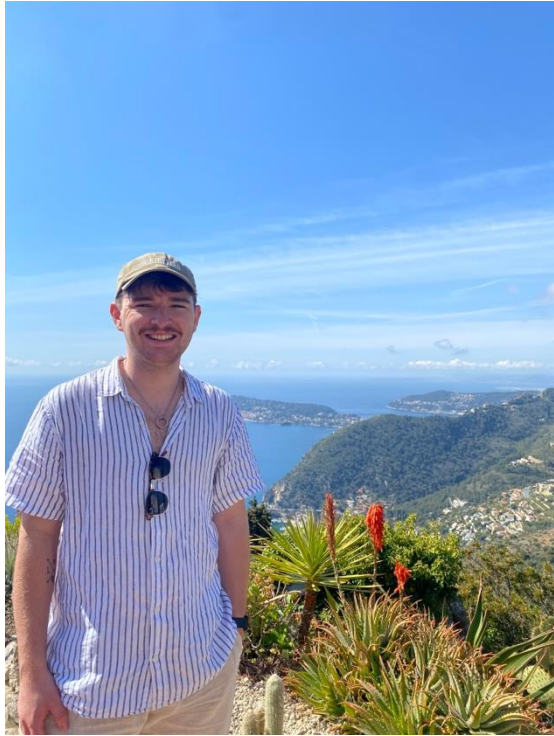
Atop of Eze in Nice, France!