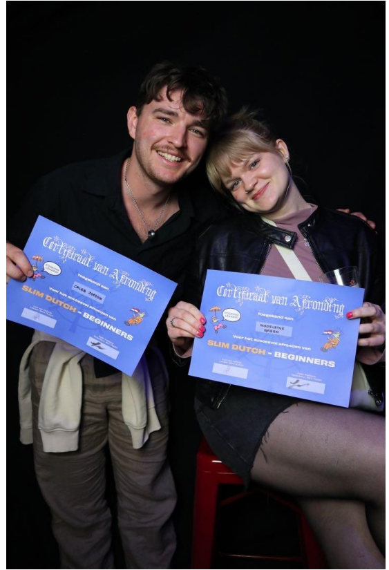
Graduation from Dutch language class!