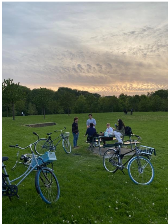
Bikes in the park at sunset!