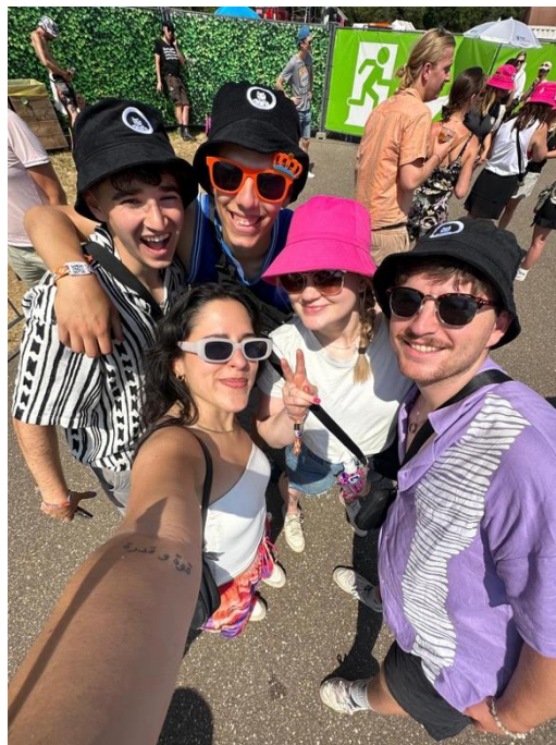
At PinkPop – Biggest music festival in the Netherlands