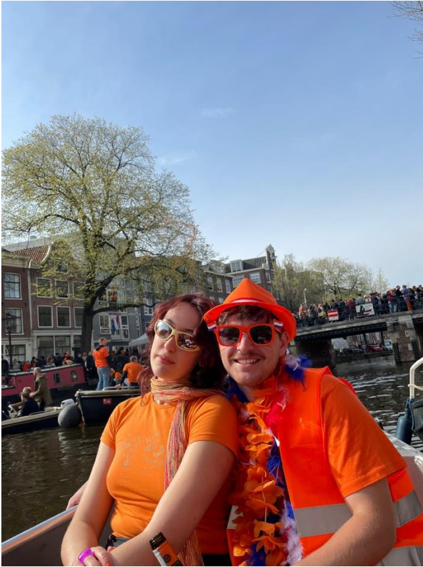
Koningsdag (King's Day) – The biggest day of Celebration in NL