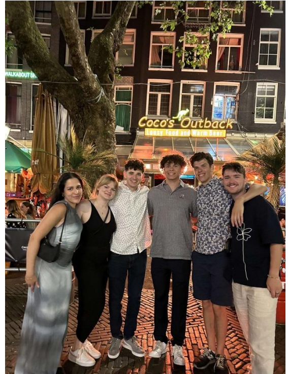
Outside Coco's where ESN hosted intro week parties