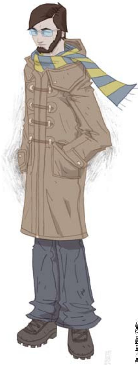
Illustration: Elliot O'Sullivan