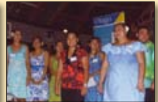
Auckland, Auckland Events Centre, November