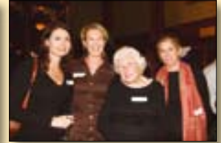
Christchurch, Christchurch Art Gallery, September