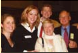
London, House of Commons, September