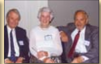
Queenstown, Mount Soho Winery, November