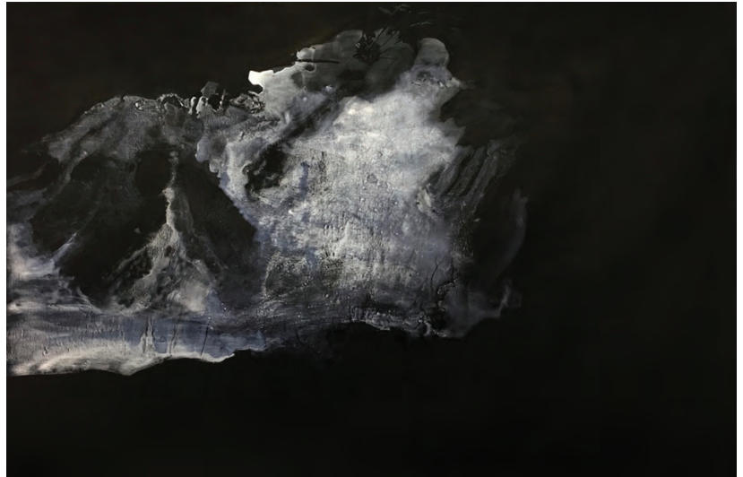
Image: Sue Pearce Toitu Stream 1 , 2015, acrylic and black gesso on paper