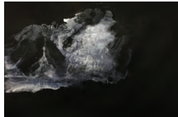
Sue Pearce Toitu Stream 1 , 2015, acrylic and black gesso on paper