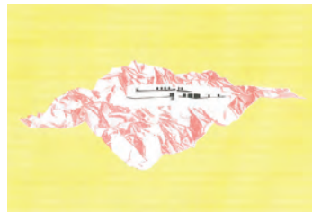
Greg Thomas Untitled , 2015, risograph print