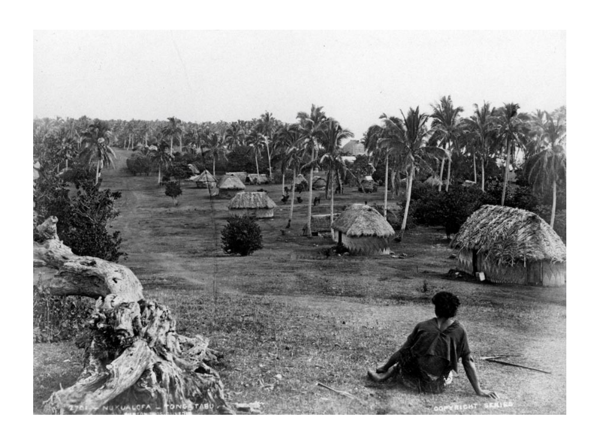
'Nukualofa – Tongatabu,' from the Burton Brothers 'Camera in the Coral Islands' series, 1884. Photograph collection, P98-068 [S10-024a].

Hocken Collections/Te Uare Taoka o Hākena 90 Anzac Ave, PO Box 56, Dunedin 9054 Phone 03 479 8868