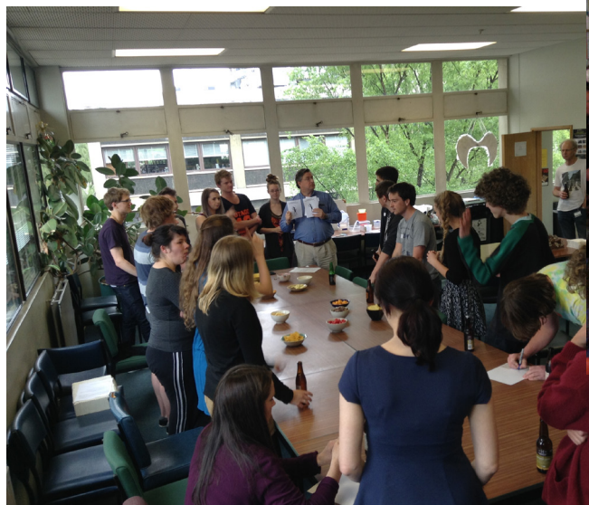
We had an orientation get together for this year's crop of Summer Students