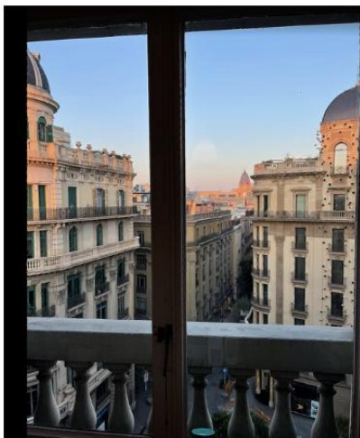
View from my apartment

from what I'm used to at Otago, in the best way. Getting to campus was a bit of a mission compared to my usual short walk, but it was totally worth it. Classes were mandatory, which meant everyone actually showed up, and it created such a collaborative and engaging atmosphere. The lecturers were all people with real-world experience, many of them ran their own businesses or worked as consultants, so their insights felt super current and practical. I also loved how much group work we did; it wasn't always easy, but it pushed me to work with students from all over the world, and it gave me a much broader perspective on how people from different cultures think and solve problems. Outside of class, I had the chance to really soak up life in Europe. I managed to visit eight countries while I was there, which still blows my mind, and I made some incredible memories along the way. But more than the travel, what really stood out to me was how much I enjoyed the rhythm of Spanish life. I loved the casual midweek catch-ups with friends at little bars, the long Sunday tapas lunches, and just the feeling of living in a city that's full of energy and culture. I also made close friendships with people from all over: France, America, Brazil, Italy, Ireland, and more.