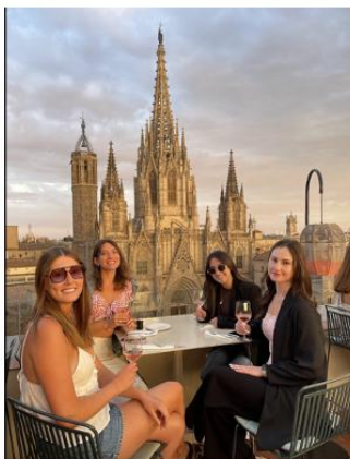
My Flatmates and I