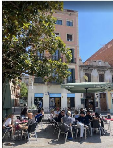
I loved to sit in plaza's with my friends – this is plaza del sol.