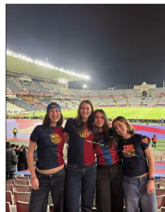
Uni friends at a Barca game