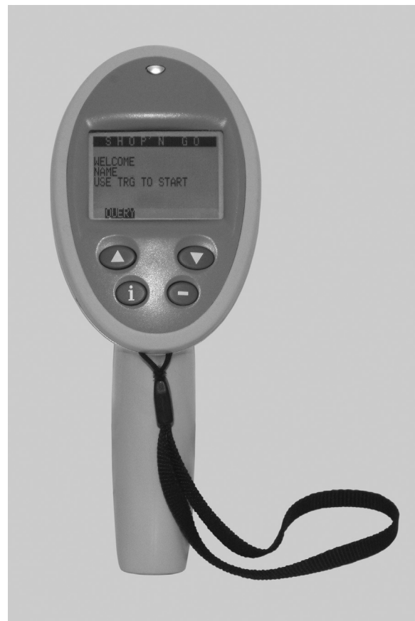
Fig. 1 Hand-held barcode scanner (Shop 'N Go system)

A 12-week single-blind RCT was conducted at a supermarket store in Wellington, New Zealand, between April