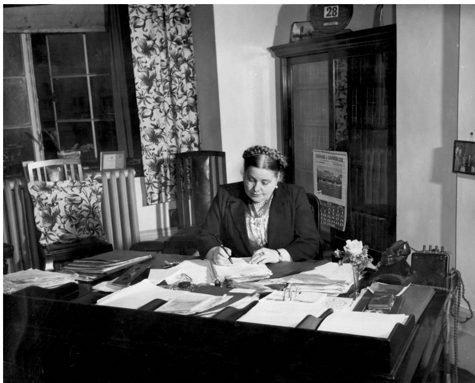
New Zealand Minister of Health Mabel Howard in her office, 28 June 1949, E.J. and Mabel Howard papers, MS-0980/286, Archives & Manuscripts Collection, S08-002e.