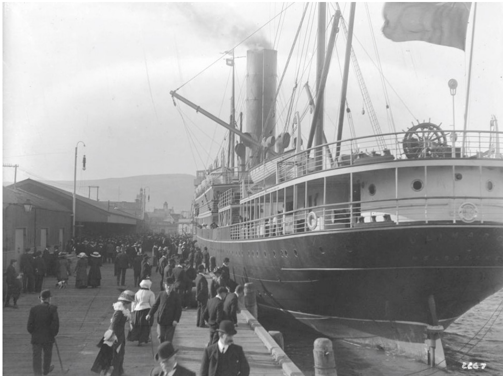
Ulimaroa, 1908-1916.