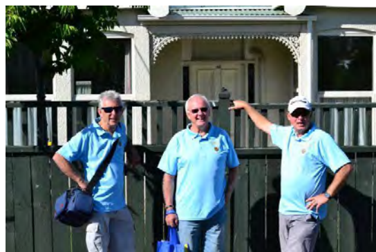
Infamous 109 Dundas St

Left: The welcome BBQ would be nothing without the original Camp '69' tee shirt airing. Evidence that one or two still exist!