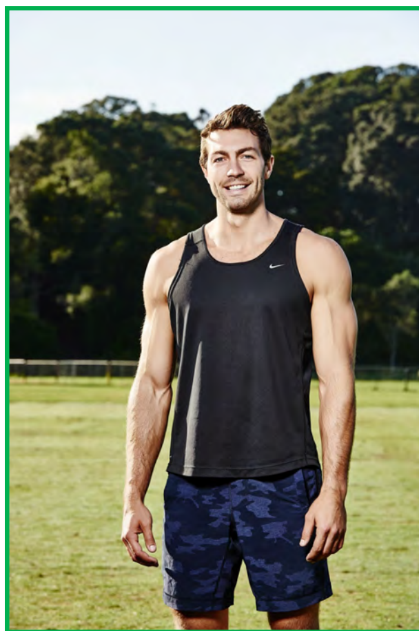
Art in workout mode at an Auckland park 2015